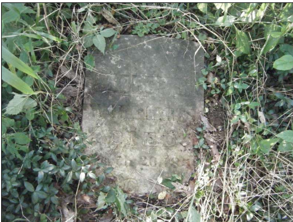
Photograph of a fallen and broken headstone documented at 46-HM-274.