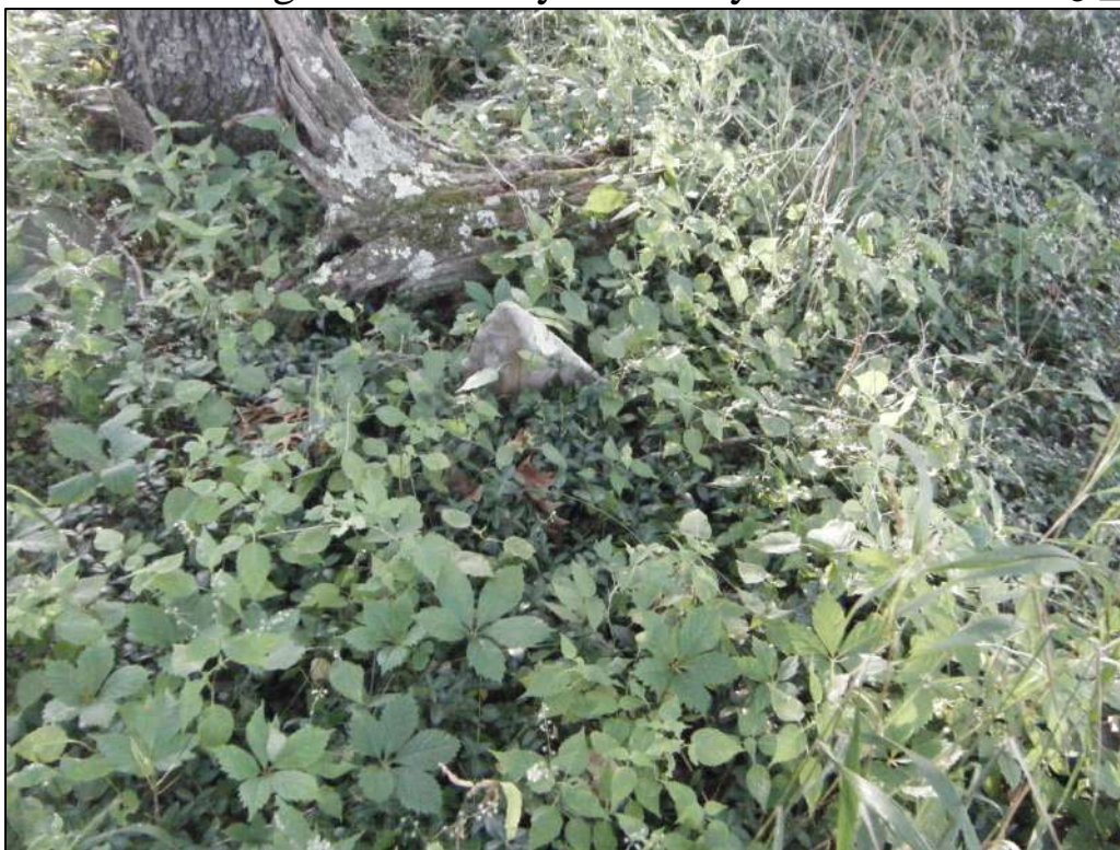
Photograph of a fieldstone marker encountered at 46-HM-274.