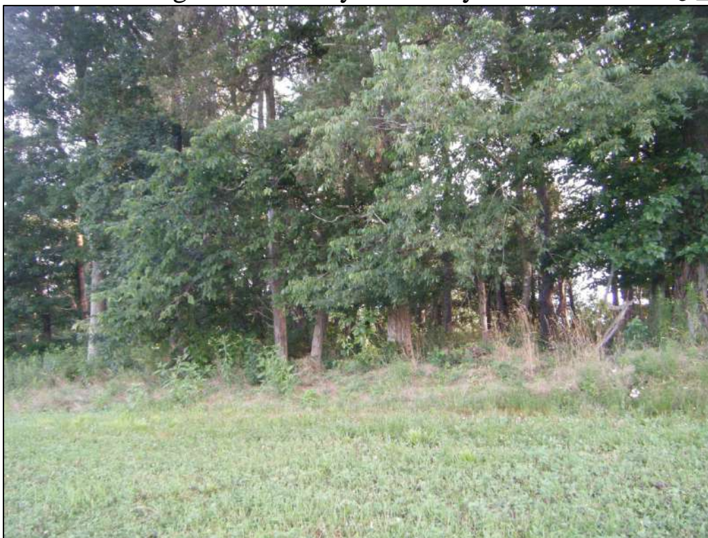
Photograph of 46-HM-274, looking west.