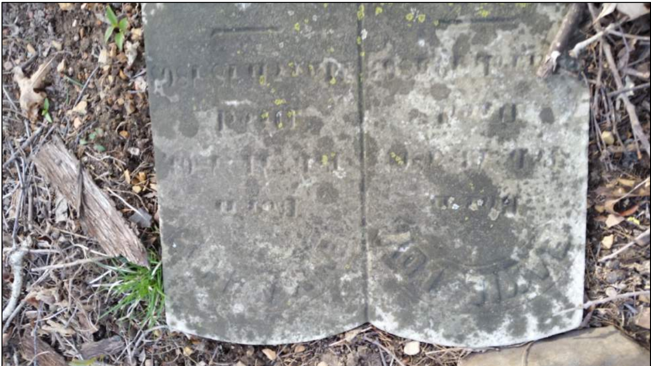
Photograph of a toppled headstone documented at 46-HM-172.