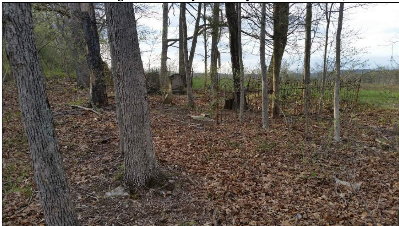
Photograph of 46-HM-172, looking west.