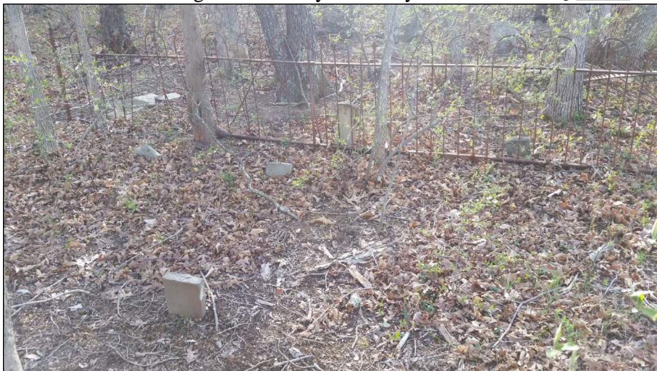
Photograph of headstone situated outside of the fenced area of 46-HM-172.