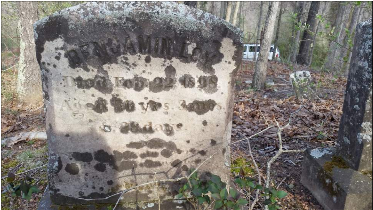
Photograph of a headstone documented at 46-HM-172.